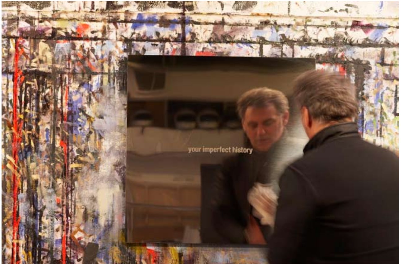
your imperfect history 1/3 2008 14 gauge stainless steel and MDF support 76 x 76 cm / 30 x 30 in